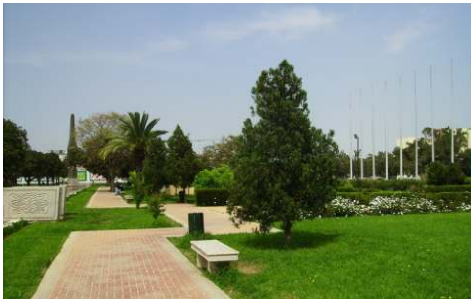
Garden of Human Rights, Tunis. Design office Cypress.