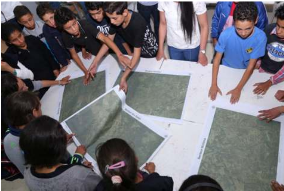
Initiating Schooled children to land planning through mediation workshops

This project is funded by SouthMed Cultue Value and co-funded by the European Union in the framework of the regional programme Med Culture. It has also benefited from the technical support of the Association of Landscape Architects of Quebec.