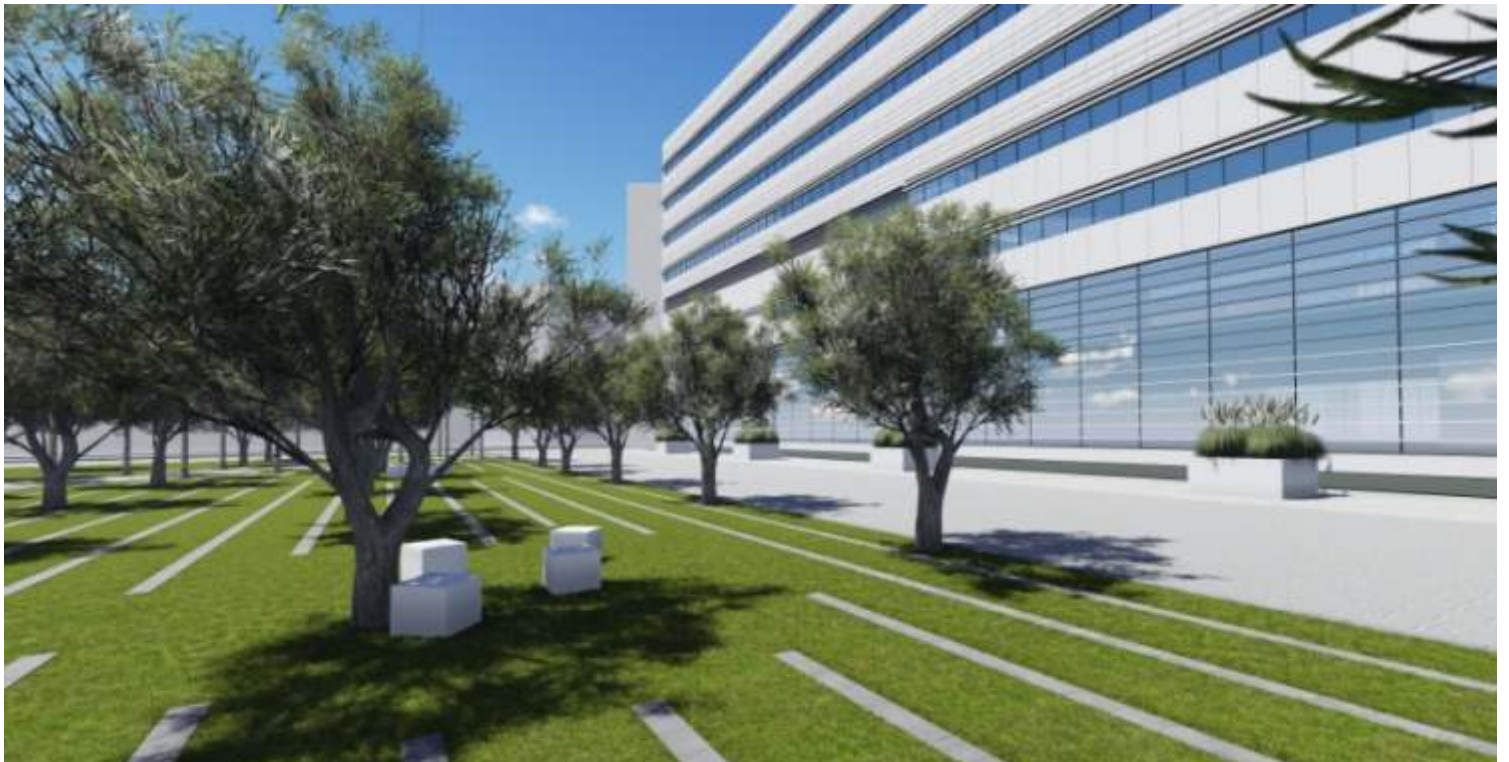
Square north urban center, design OM-landscape designer